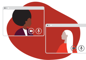
Connecting with family and friends