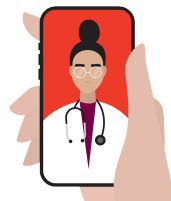
Virtual visits with doctors and nurses