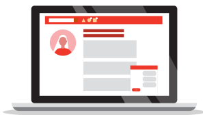
Finding new customers for their small business