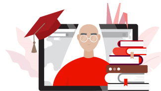
Accessing virtual classrooms for kids and adults